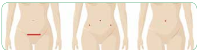
Open Surgery Incision

** With minimally invasive surgery, there are various options for removing the uterus. Your surgeon will suggest the option he/she thinks is best for you.