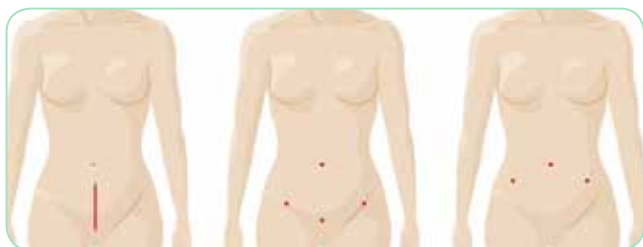
Open Surgery Incision

There is another minimally invasive surgical option for women diagnosed with endometriosis - da Vinci Surgery.